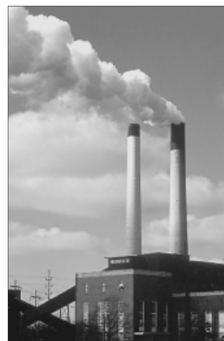
The Abbott coal plant

Switching off of coal would send a strong message to the state and to other universities that climate change is a serious problem and we need to start taking action. Natural gas is not a permanent solution, but it is a transition fuel while we build the infrastructure for a zero-carbon economy and national energy system.