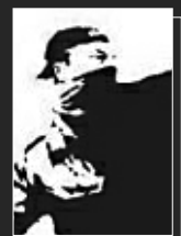
Guerrillas In Our Midst Imperator Infiltrator Page 7